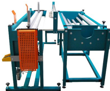
wersja z NT-1/L version with NT-1/L версия с NT-1/L