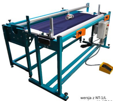
wersja z NT-1/L version with NT-1/L версия с NT-1/L